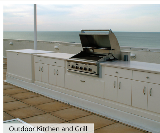
Outdoor Kitchen and Grill